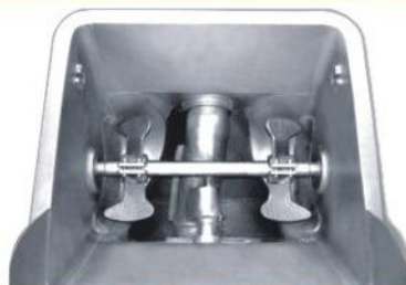
摆动及搅拌机构：采用动压双层密封及隔离漏浆设计。 Swing and mixing mechanism with double layer sealing and isolated leakage device.