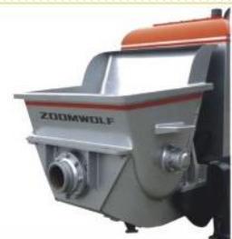
三维几何优化料斗 3D-geometry optimized designed hopper.