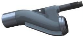
优化设计的S管 S-tube with optimized design